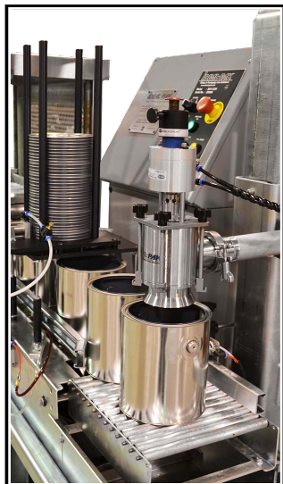
Shown with Optional 23-M-G One Gallon Metal Lid Placer and Closer Guards

The SV1-CEM is a semi-automatic volumetric filler and closer for filling open top quart to 5 gallon containers. Placing a container under the nozzle begins the fill cycle by contacting the no-can-no fill switch. After filling, the container is advanced by the operator to the conveyor. Containers are conveyed through a heavy-duty roller closer.