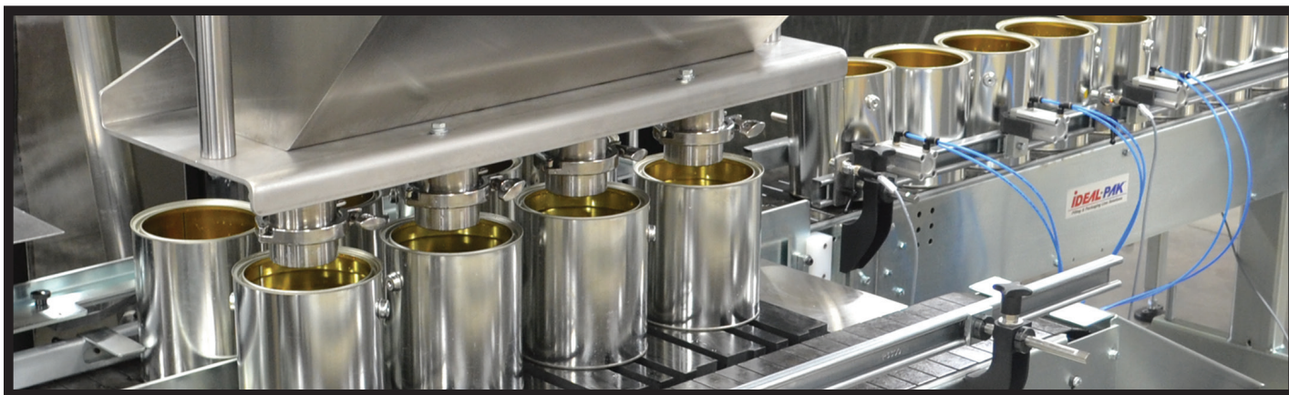
Ideal-Pak® Model AE4-LAM Automatic Electronic Net Weight Filling And Closing Machine For Filling Pint Through 1 Gallon Containers