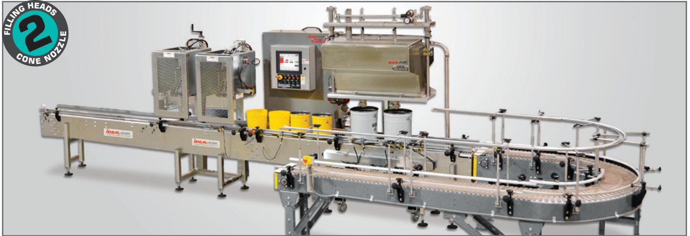
Ideal-Pak Model AE2-CFM Two Head Automatic Net Weight Liquid Filling Machine with DFS® Direct Fill System, Powered In-Feed Conveyor, 2 Gallon Crimper and 5 Gallon Crimper (optional).